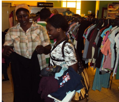
Item 17 Price: $20

Your gift will pay for one outfit of clothing for a refugee child.