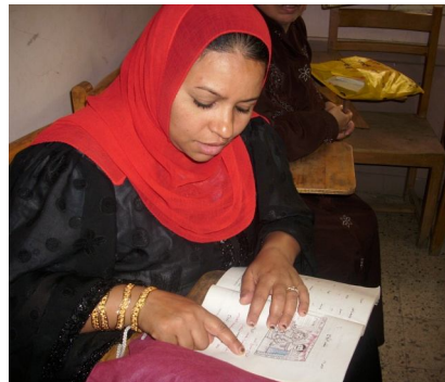
Item 7 Price: $35

Your donation will allow one woman to attend a six month literacy class.