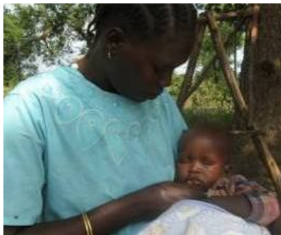
Item 13 Price: $35

Your gift will pay for medical treatment for someone when they need it.