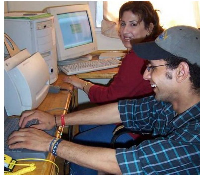
Item 6 Price: $40

Your gift will subsidise the cost of a computer skills course for a young adult.