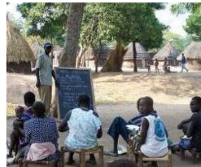
Item 5 Price: $8

Your gift will provide notebook and pens for one student.