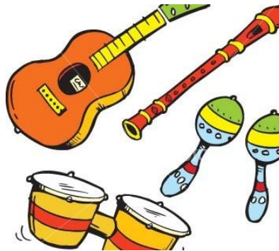
Item 8 Price: $20

Your gift will help the school in equipping a music room with instruments.