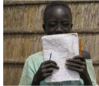
Item 3 Price: $20