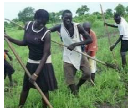
Item 15 Price: $25

Your gift will purchase a set of agricultural tools for a farmer in Ethiopia.