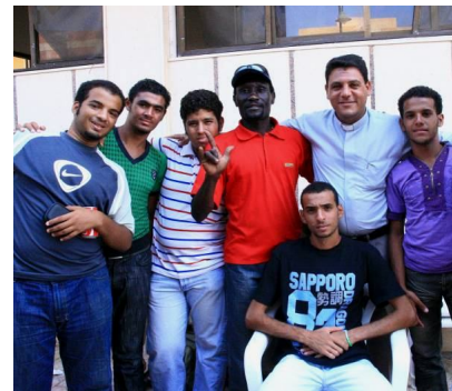
Item 26 Price: $250