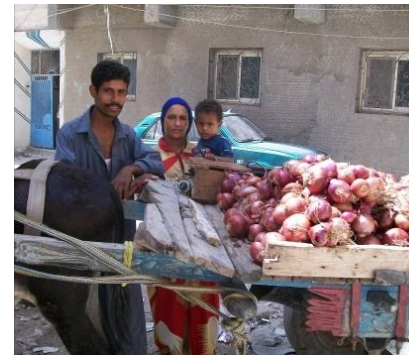
Item 14 Price: $100

Your gift will pay for one micro-loan for an Egyptian man or woman to his/her own business.