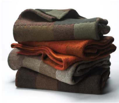
Item 16 Price: $10

Your gift will provide a blanket to keep a child or adult warm in winter.