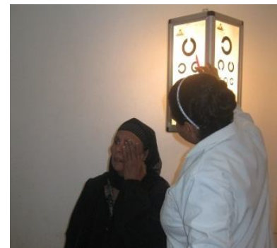
Item 10 Price: $100

Your gift will pay for cataract surgery for one person at Harpur Memorial Hospital in Menouf.