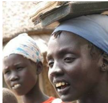
Item 22 Price: $20

Your gift will buy 5 Bibles or 3 hymn books for a church in Ethiopia.