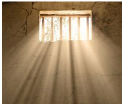
Item 18 Price: $15

Your gift will pay for basic supplies for one prisoner for one month.