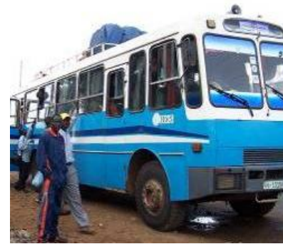
Item 19 Price: $50