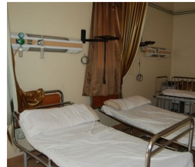
Item 9 Price: $10

Your gift will pay for one inpatient to stay for one night at the hospital.