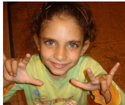
Item 2 Price: $40

Your gift will subsidise the costs of education and board for one child.