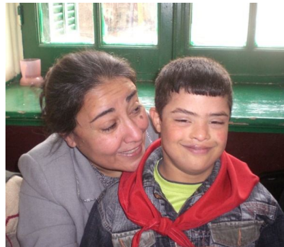
Item 1 Price: $40

Your gift will subsidise half of the cost for one of these children for one month.