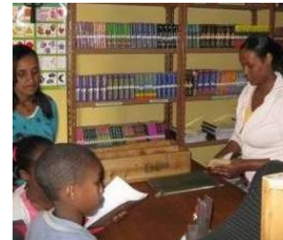
Item 4 Price: $35

Your gift will provide exercise books, stationery, as well as a school uniform and a bag.