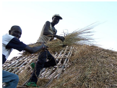
Item 23 Price: $40

Your gift will help a congregation buy the main timbers to allow them to rebuild their church.