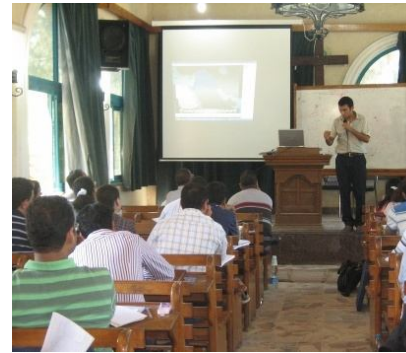
Item 24 Price: $500