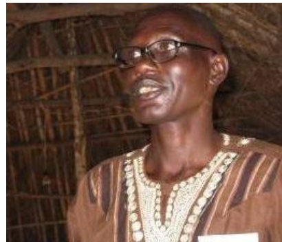
Item 12 Price: $60

Your gift will give a sight test and spectacles to someone in Gambella, Ethiopia.