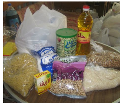
Item 21 Price: $8