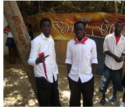
Item 20 Price: $25